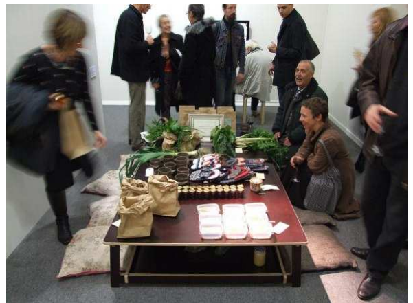
Somewhere's 'honesty table' at the opening of the Northern Art Prize, Leeds

www.internationalvillageshop.net Watch that space!